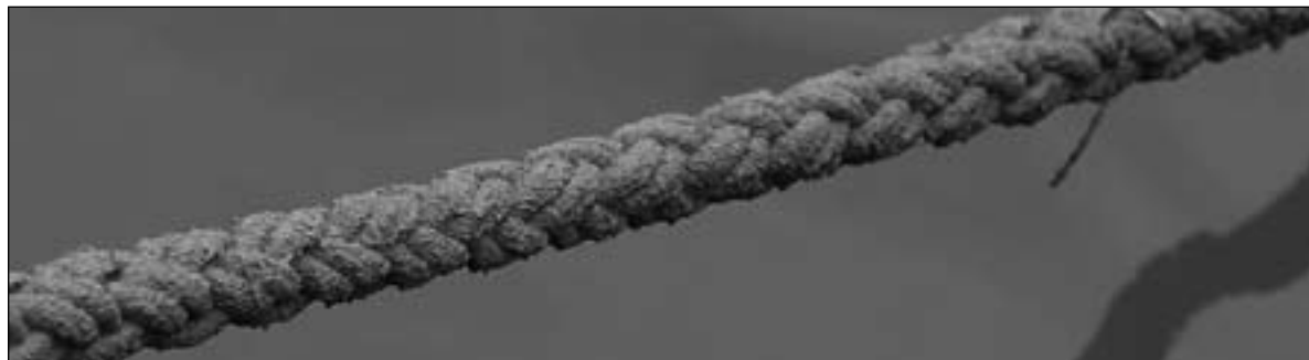
A braided rope is flexible as well as strong. The benefits are many. This principle can also apply to people.

caught in a storm. One apparently dislocated his shoulder. His friends realized he could not climb down, so they left him in an ice cave and went for help. Tragically his two friends didn’t survive the dangerous descent, and he was not able to survive on his own. He was found dead of hypothermia.