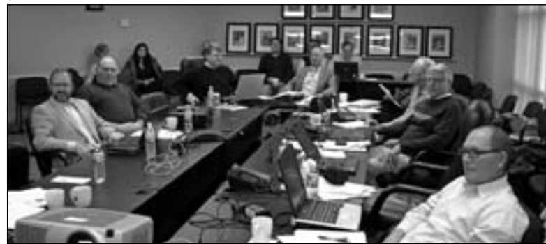
Senior pastors and associate senior pastors serving Africa, Asia and Europe meet at the home office

One of the most pressing needs in Africa is for further education and training for the leaders. Most of the leaders and potential leaders in Africa cannot realistically travel far, and entrance visas for many Western countries are