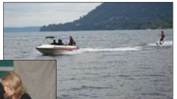
A Church member provided his boat and his time to teach waterskiing on Lake Calafquen; left, special music

classes in beautiful Lake Calafquen, which is only a few blocks from the school where we were staying.