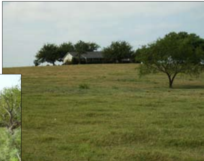
The 81.5-acre Milam Road property north of Denton, Texas, includes a creek at the south end and slopes gently up to a crest where the major Phase I buildings are planned (replacing the house in the photo above).