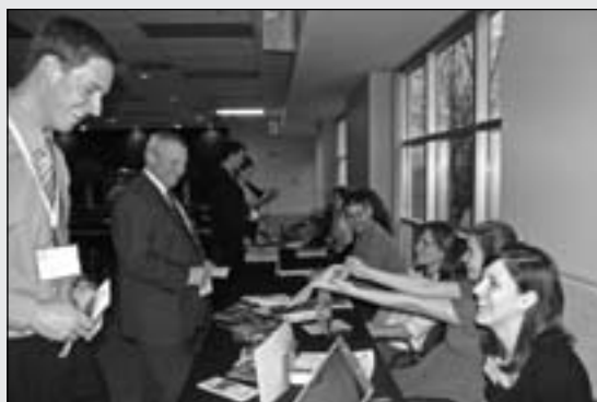
New ABC students receive guidance from alumni and enjoy reception Jan. 6

The Ambassador Bible Center began its ninth year with orientation on Jan. 6. The class this year will have 34 students from 18 different states and one international student from Australia. The students range in age from 18 to 67, with 19 men and 15 women.